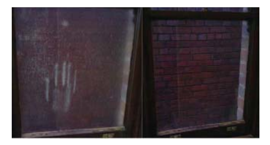
Figure 3. An example of a Level 2(e) handprint. The image (left) appears outside, on a windowpane. In this case, it was on an upper floor of an apartment building. The photographer returned the next day to take more photos of it, but it was gone (right). Based on this, the observers concluded that it was not from a human source.