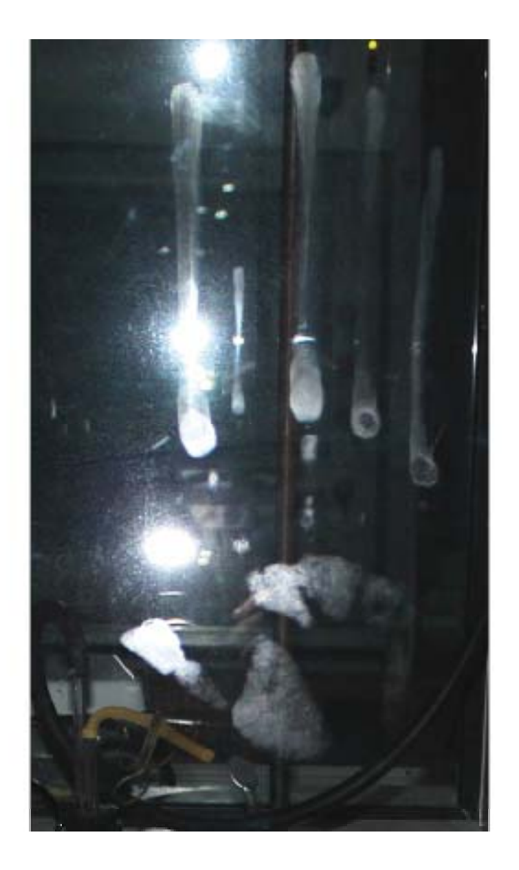
Figure 5. Photo of an "alien handprint" made on a glass surface and photographed in the dark with a flash camera.