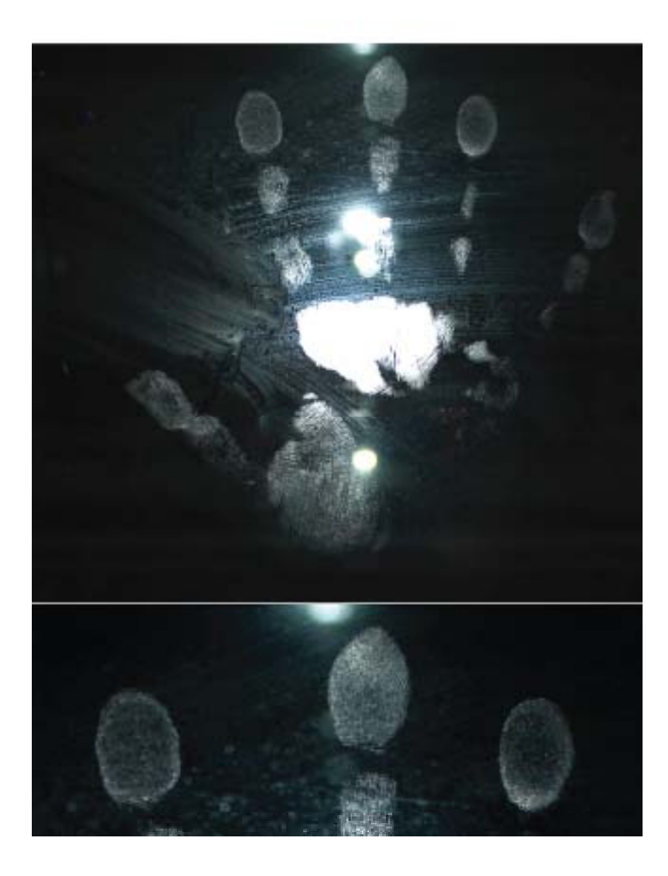
Figure 4. Photo (top) of a Level 2(i) handprint (top) made on a glass surface, and photographed in the dark with a flash. The image on the bottom shows the detail retained in some of the fingerprints, because they are from a human source.