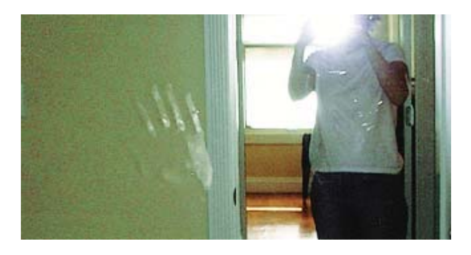
Figure 2. A Level 2(i) handprint on a bathroom mirror. After it appeared, the observer captured the image with a digital flash camera. The image appeared to be composed of a white powdery substance.

photodocumented using a digital camera with the flash on.