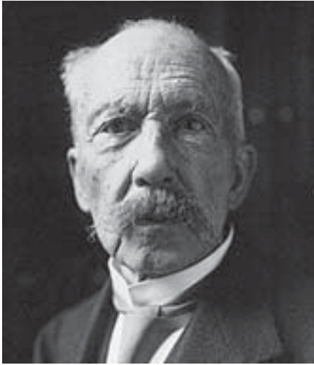
Figure 1. Charles Richet

information about Richet's interest in psychic phenomena via his own, admittedly brief, account.