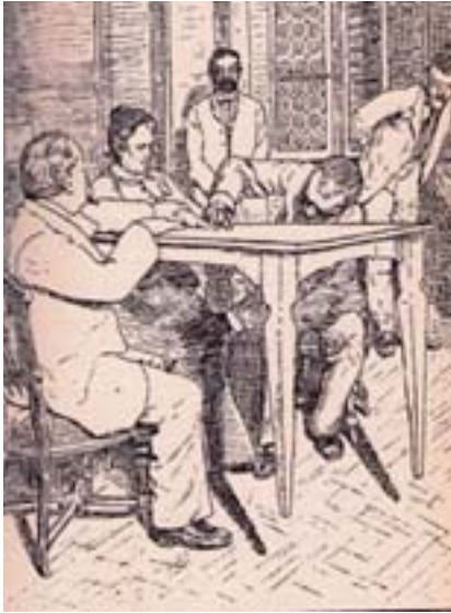
Figure 4. Séance with Palladino in Milan 1892. Controlling the medium (sitting Lombroso left and Richet right). Published in Richet (1893:7).

see one of these facts," I said, "I would go to the end of the world." He only smiled. But some time later he wrote to me: "it is not about going to the end of the world, but only to Milan." 11