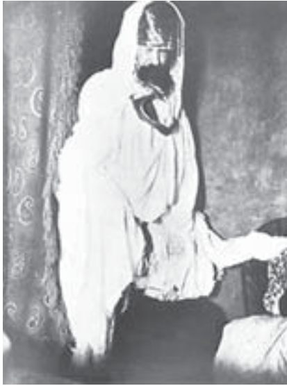
Figure 2. Bien Boa

ESP literature, was Richet's article about mental suggestion, or the "influence that an individual's thought exerts over a specific sense, without an appreciable exterior phenomenon on our senses, over the thought of a nearby individual" (Richet 1884b:615). This included transmission of thoughts and images, as well as other effects such as the induction of trance at a distance. In the paper, Richet described his use of statistical analyses in several guessing tasks with various targets, as well as discussions of conceptual ideas such as the unconscious nature of the process (see also Alvarado 2008).